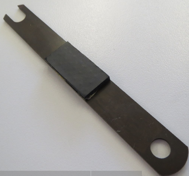
06.3121 Mtg. Strap